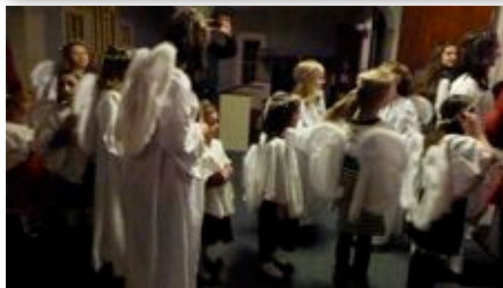
The multitude of the heavenly hosts awaits their cue to enter. Christmas Eve Family Service 2011